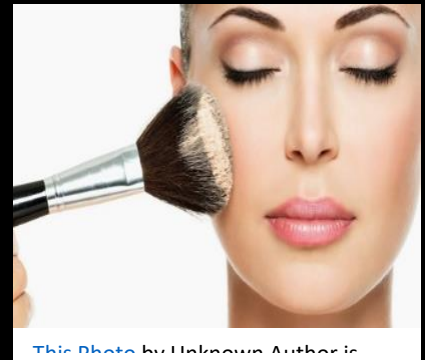
This Photo by Heleneus Author is